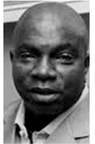
Hon. Shamsudeen Olaleye

The Local Government Education Authority (LGEA) also stated that it has contacted that Board to make sure all precautionary measures are put in place to ensure maximum safety of the pupils.